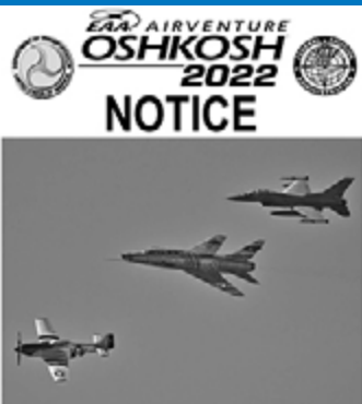
Oshkosh Notam now available