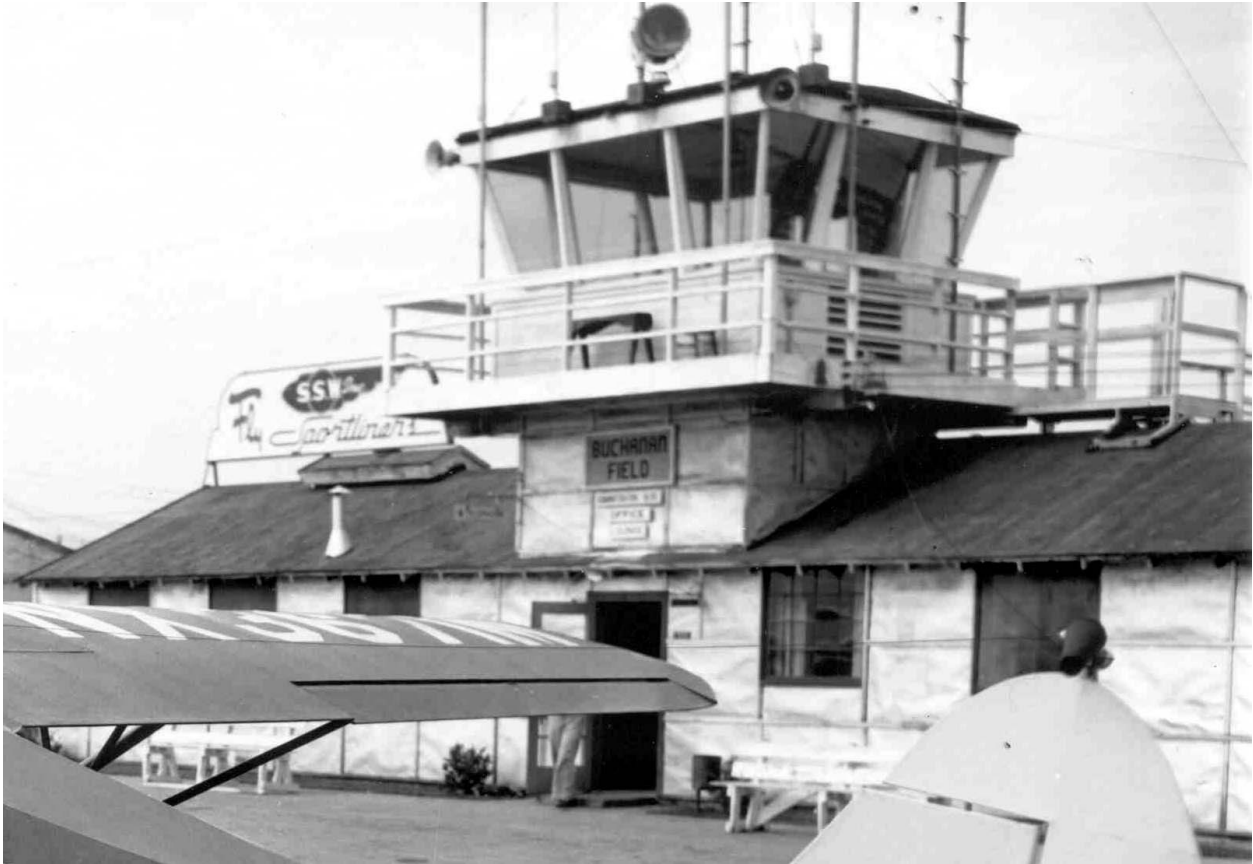
A few years later: