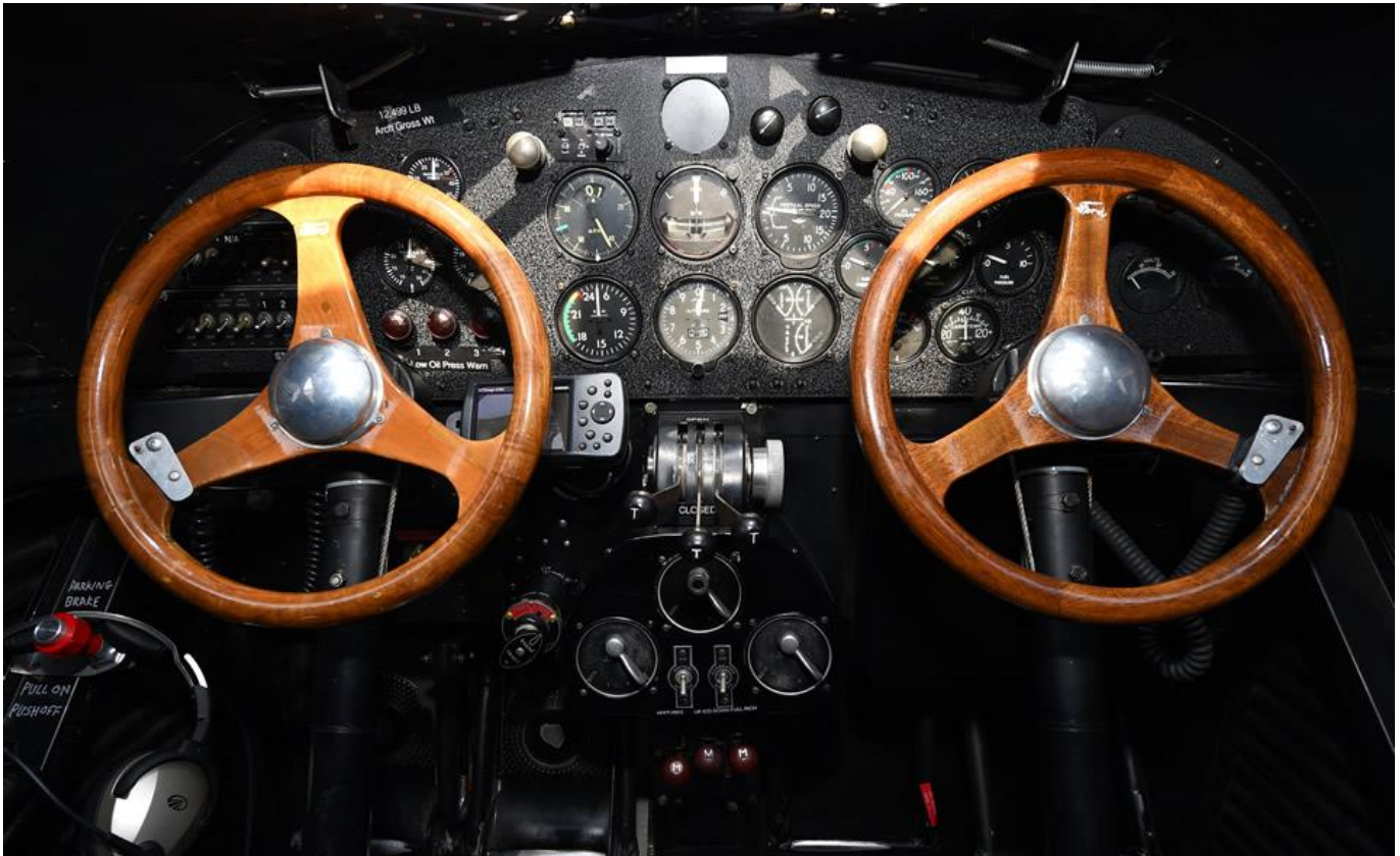
An inside pilot's look at the Ford Tri-Motor.