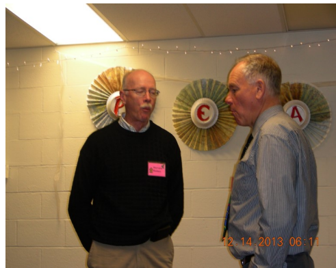
Deep thinking if they were good boys this year.