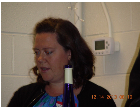
Our Bartender and a darn good one at that. Our thanks.