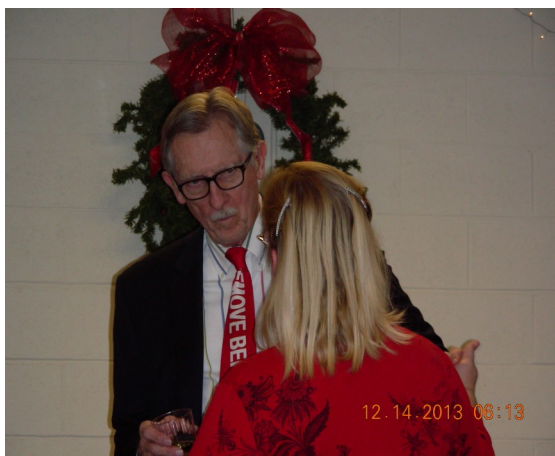
A great listener.