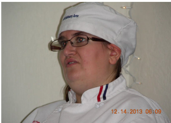
One of the great service staff. You are truly appreciated.