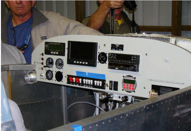
Pete Wiebens' Glasair III reconstruction: