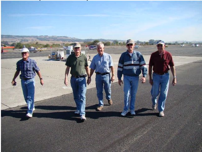
Lunch at the Two-Niner Diner: