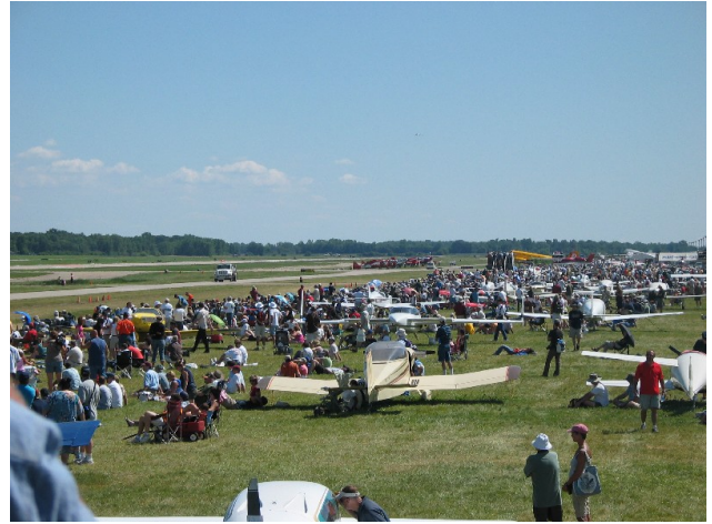
We adjourned after the slide show.