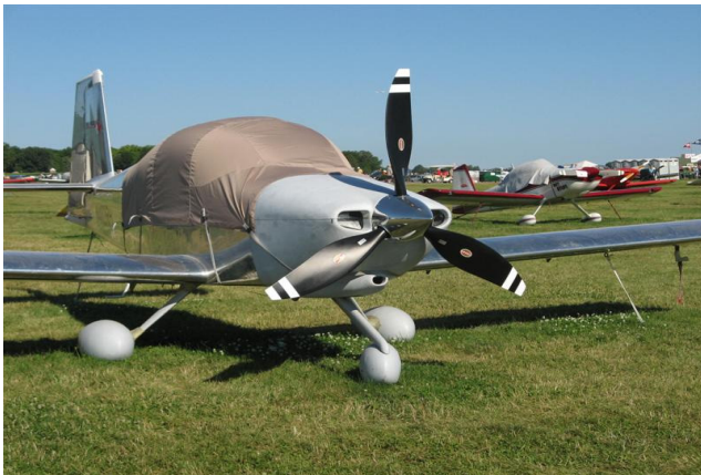
The new "fat" 3 bladed prop.