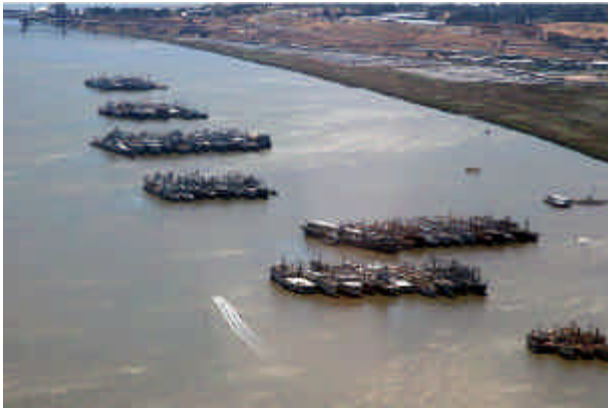
The mothball fleet