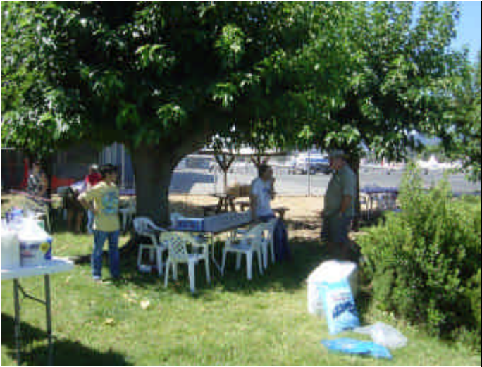
The picnic is READY!! (Well almost)