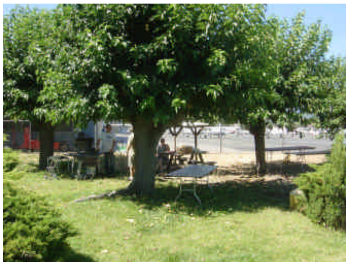
In the beginning...