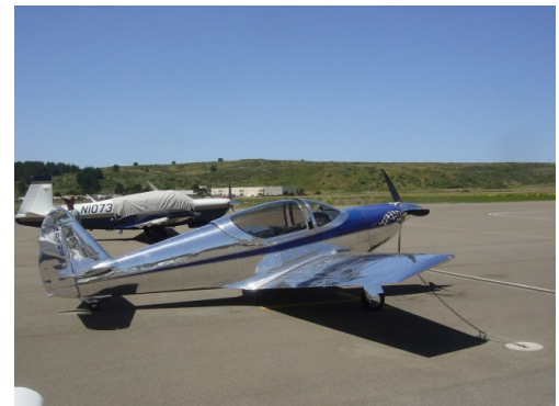
• Bruce Seguine's Swift